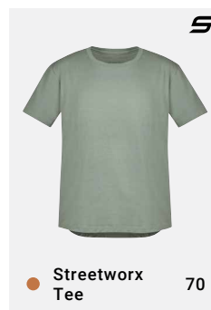
● Streetworx Tee 70