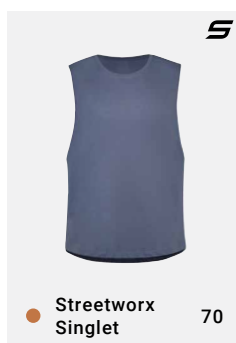
● Streetworx Singlet 70