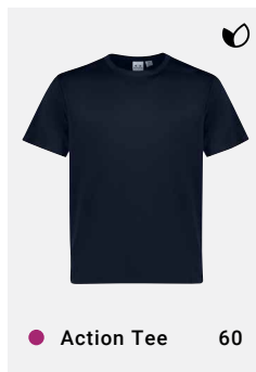
● Action Tee 60