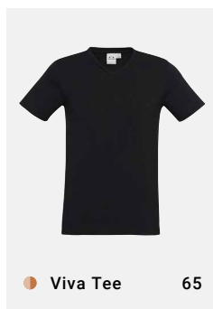
● Viva Tee 65