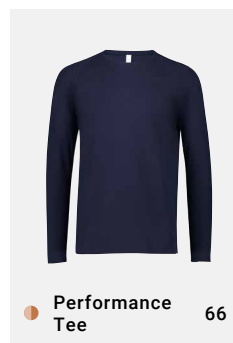
● Performance Tee 66