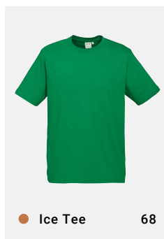
● Ice Tee 68