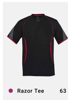
● Razor Tee 63