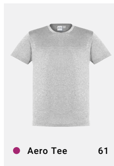
● Aero Tee 61