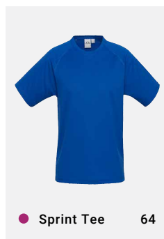
● Sprint Tee 64