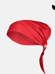
● Twist Bandana 292