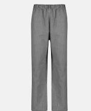
● Dash Pant 289