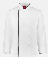
● Al Dente Jacket 287