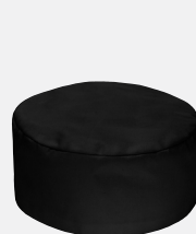
● Flat Top Cap 293