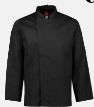
● Alfresco Jacket 285