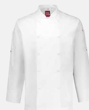
● Gusto Chef Jacket 284