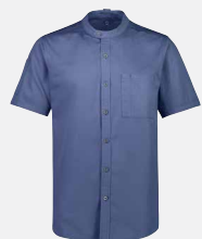
● Salsa Shirt 288