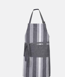
● Salt Apron 298