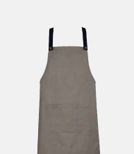
● Urban Bib Apron 296