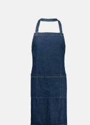
● Clout Apron 294