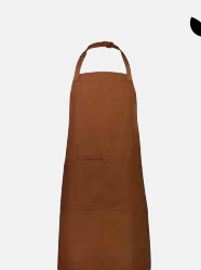
● Barley Apron 295