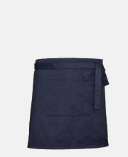
● Urban Waist Apron 297