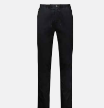
● Saffron Pant 290