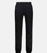
● Cajun Pant 291