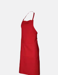
● Bib Apron 299