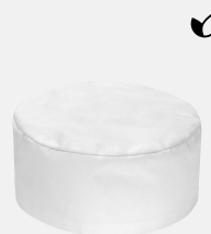
● Mesh Flat Top Cap 292