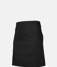
● Short Waisted Apron 299