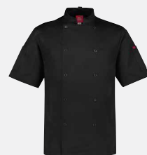
● Zest Jacket 286