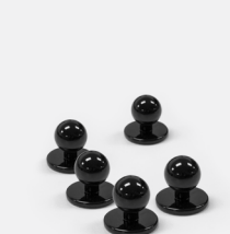
● Chef Buttons 293